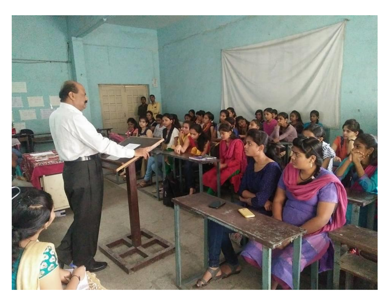
'Indian Financial System – Financial Intuitions and Laws Related to Banking in India.' Conducted on 26th September 2023